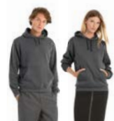
with B&C Hooded