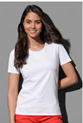
ST7600 Lux Fitted