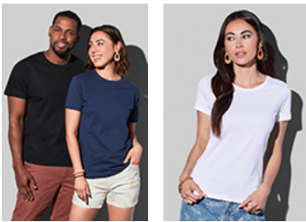
ST2020 Classic-T Organic