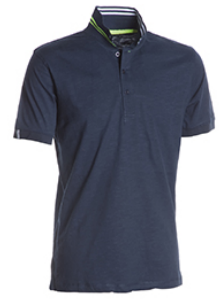
DENIM BLUE/WHITE-FLUORESCENT YELLOW