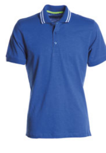
NAUTICAL ROYAL/WHITE-FLUORESCENT YELLOW