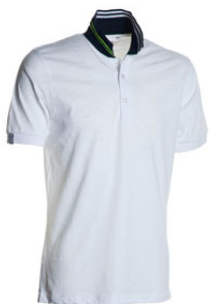
WHITE/NAVY BLUE-PASSION RED/WHITE-FLUORESCENT YELLOW