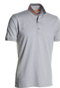
LIGHT GREY/BLACK-FLUORESCENT ORANGE