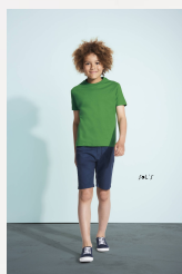
IMPERIAL KIDS 11770