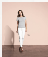
IMPERIAL WOMEN 11502